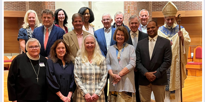
Board of Trustees, past and present, who joined the Mass

39% Hispanic, 31% White, 19% Black or African American, 8% Multiracial, 2% Asian, 1% Other